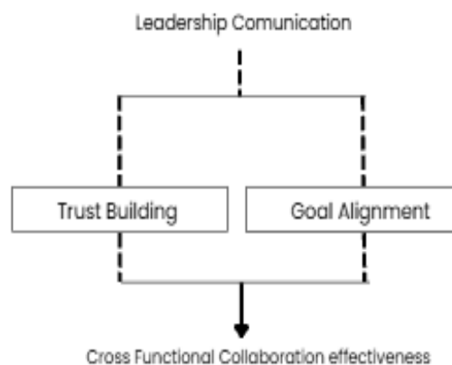
Figure 1. The Dual-Path Mechanism of Leadership Communication

This study addresses the gap by developing a conceptual framework that explains how leadership communication promotes cross-functional collaboration through trust formation, shared goal alignment, and workflow coordination across functional units. This theoretical integration serves as the conceptual foundation for the analyses presented in later sections of the paper.