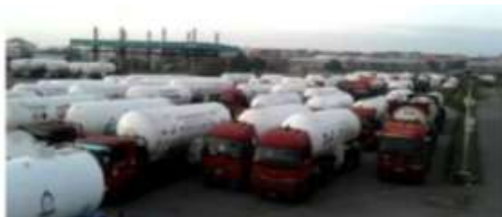
Figure 1. Gas Tanker Queue at OPSICO